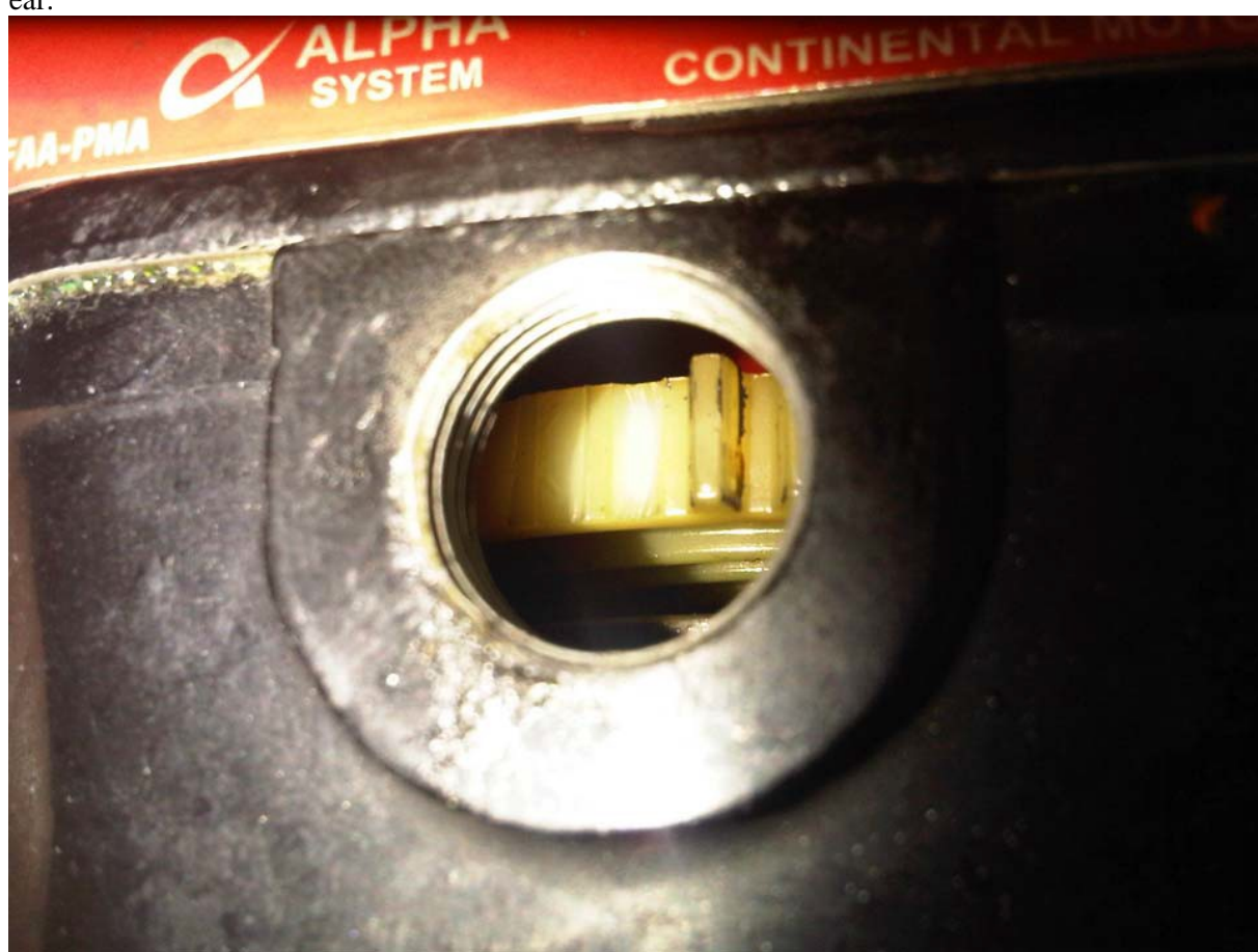
We highly recommend this suggestion to the manufacturer."